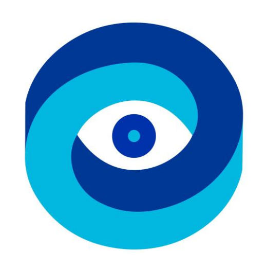
Part 1. Introduction: What is nystagmus?